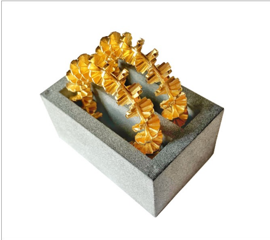
Gérard and Lucien Grandval Earrings « Colimaçon » in their concrete case, Vermeil, 2020, edition of 15 édition MiniMasterpiece © Lucien Grandval