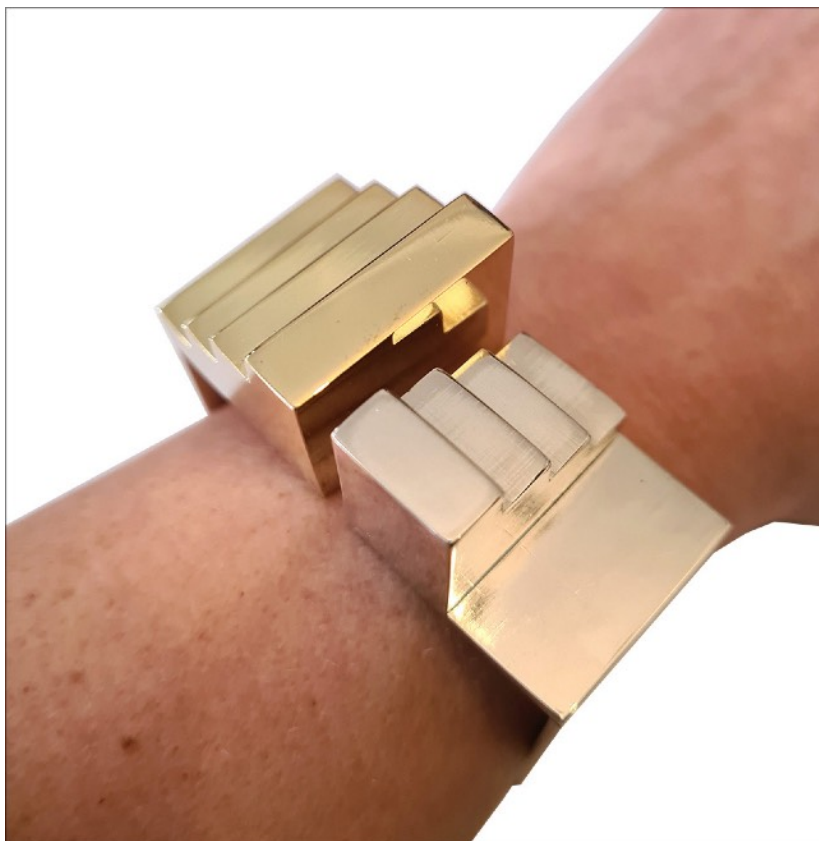
Gérard and Lucien Grandval Bracelet « Double » Sterling silver et golden brass 2020, edition of 10 édition MiniMasterpiece © MiniMasterpiece