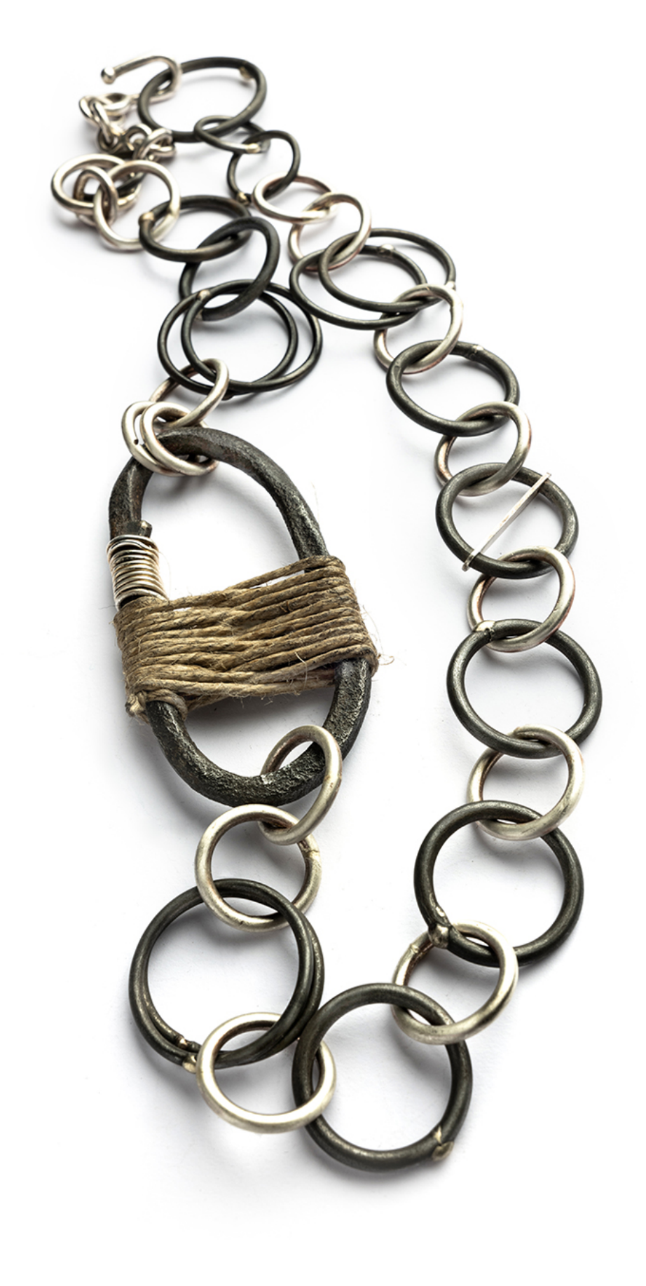
Chain #7 Sterling silver rings, steel welded with a drop of silver, silver-tied iron and rope 2024, unique piece for MiniMasterpiece © atelier Grisoni