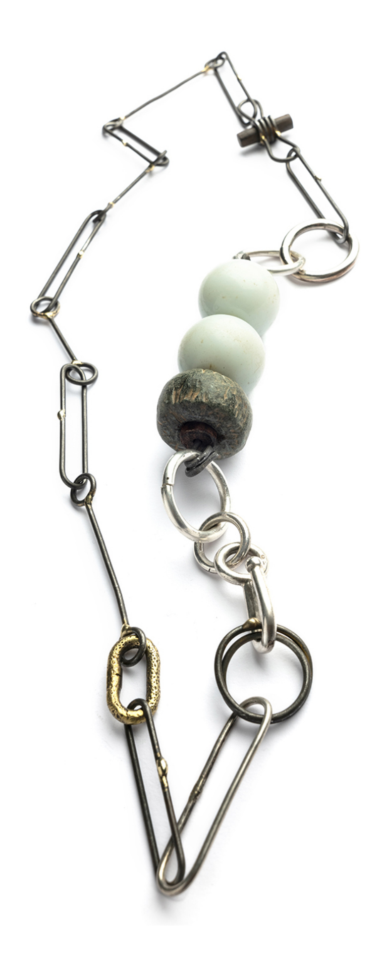
Chain #3 2 Dutch glass beads (17th century) and 1 spindle whorl (1st century, Mediterranean) mounted on an iron bar. Sterling silver rings, steel rings welded with 18k gold and 1 bronze ring. 2024, unique piece for MiniMasterpiece © atelier Grisoni