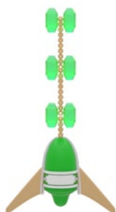
Earrings, two versions : green enameled Sèvres porcelain and green onyx and black enameled Sèvres porcelain and pink quartzite, 18k yellow gold, edition of 15 + 2AP -