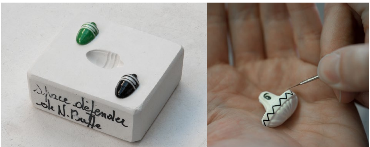
Space Defender mould, black and green enameld Sèvres porcelain, Manufacture de Sèvres, © Yann Delacour

The concept behind this jewel comes from the combination of two worlds that at first might seem to be in opposition. On the one hand, there is the Manufacture de Sèvres, emblem of the prestigious history of French porcelain since the 18th century, also embodying a certain notion of refinement and fragility. On the other hand, there is Shoot'em up, which as the name suggests, is a frantic action video game in which the aim is to eliminate ever more enemies from outer space appearing on the screen.