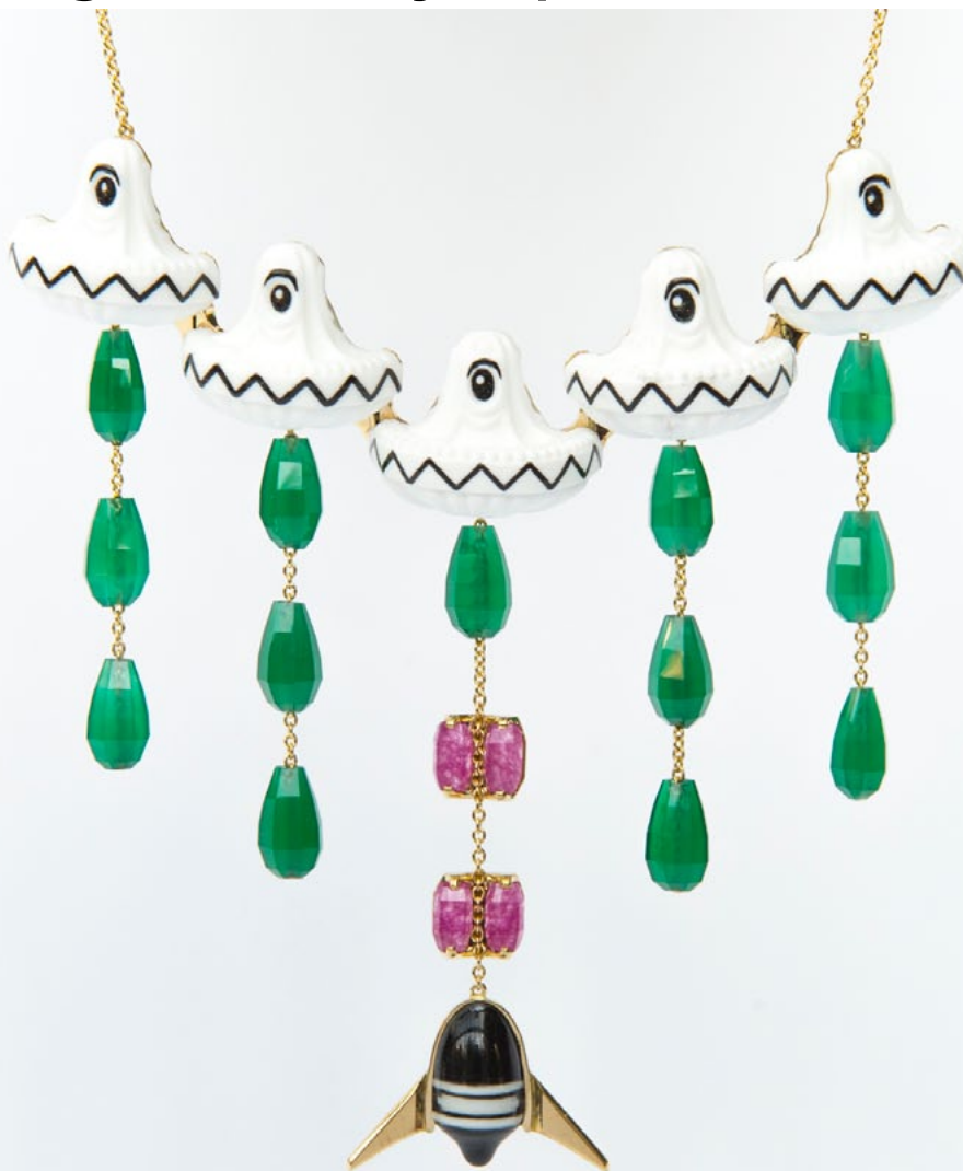
Shoot'em up , necklace, Sèvres porcelain, black enamel, 18k yellow gold, green onyx and pink quartzite, edition of 10 + 2 AP 2019 © Yann Delacour

Opening night Thursday September 19, 6 to 8 PM