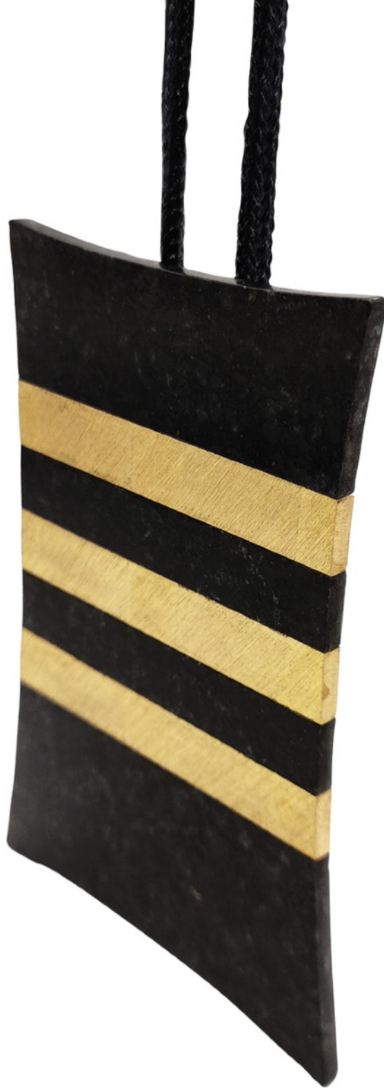
Enrique Asensi Pendant in diabase and brushed brass edition of 8 for MiniMasterpiece, 2021