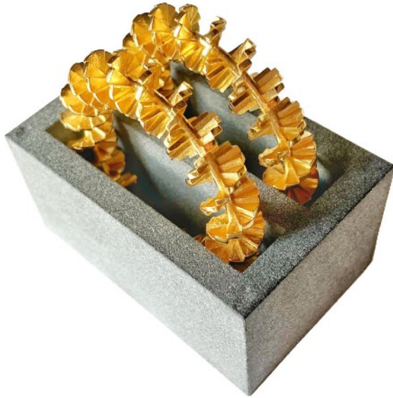
Gérard and Lucien Grandval Earrings « Colimaçon » in their concrete case, Vermeil, 2020, edition of 15 édition MiniMasterpiece © Lucien Grandval