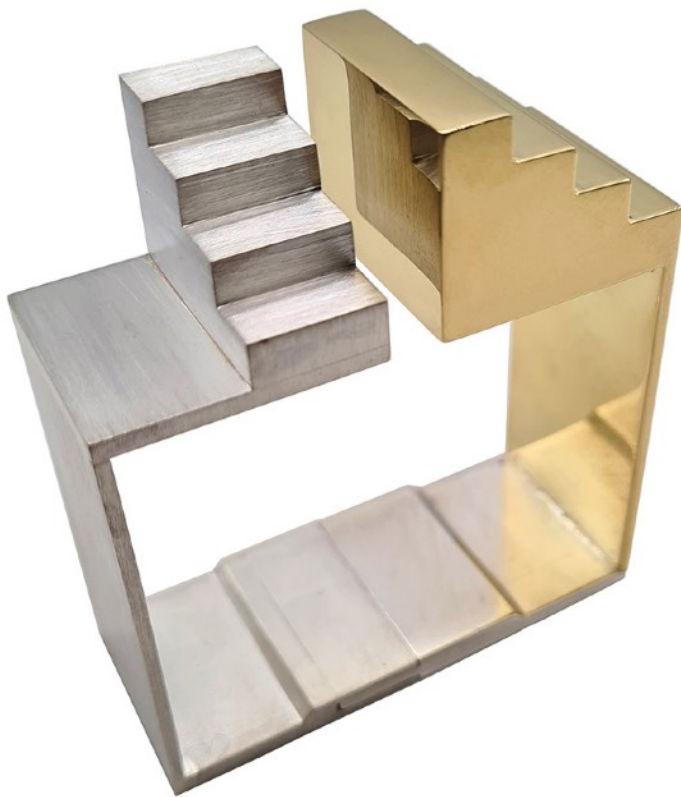
Gérard and Lucien Grandval Bracelet « Croisé » Sterling silver et golden brass 2020, edition of 10 édition MiniMasterpiece © MiniMasterpiece