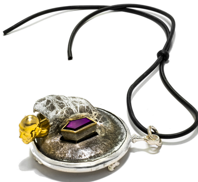
Le rat de Montedoglio Pendant necklace in sterling silver, 18k yellow gold, aluminium, quartz- amethyst and polyester - diameter 6,5 x 4 cm 2024, Unique piece for MiniMasterpiece © Alessandro Schinco